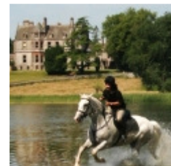
Retreat to Relaxation