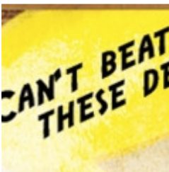
Supplies-Offers You're Gonna Want