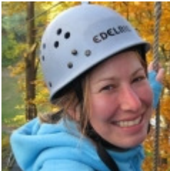
Notes From the Trail