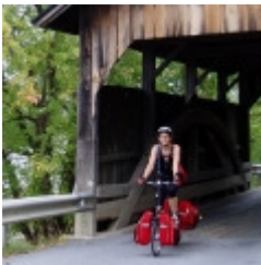
Notes From the Trail