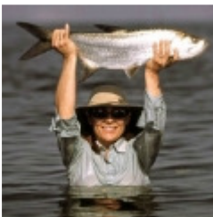
Trix's Fishing Tips