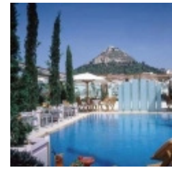
Hotel Grande Bretagne

Do' sights of Athens, Greece. Our Adventure of the Moment features the world renowned Acropolis . The views and classic beauty of Athens doesn't get any more glorious than from the Roof Top Garden of the Hotel Grande Bretagne . Visit this 140-year-old gem in Retreat to Relaxation .