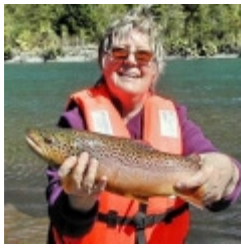
A Fishing Photo

Do' sights of Athens, Greece. Our Adventure of the Moment features the world renowned Acropolis . The views and classic beauty of Athens doesn't get any more glorious than from the Roof Top Garden of the Hotel Grande Bretagne . Visit this 140-year-old gem in Retreat to Relaxation .