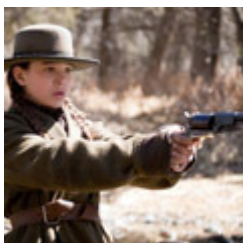
Flicks For Adventure Chicks