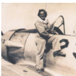
Salute! A Service Woman