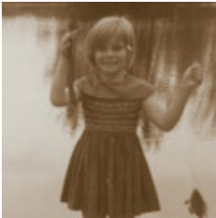
Fishing Tips & Adventures

The Armchair Adventurer (Our Book Review) - Read the book that changed the landscape of domestic violence in the United States. Francine Hughes's landmark 1977, murder case was turned into a bestselling non-fiction book by Faith McNulty entitled, The Burning Bed . The book, later made into a film by the same name (starring the late Farrah Fawcett) was the turning point in the legal handling of battered women and their abusers. A must read for single, married, young and old women.