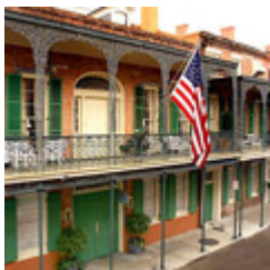
Retreat to Relaxation